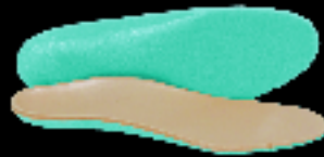
Polymer of Urethane Base 40 Durameter