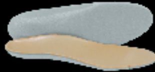
Plastazote ® X-Firm Base 45 Durameter