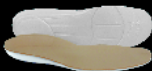
Plastazote ® Firm Base 35 Durameter