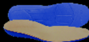
ThermoSKY ® EVA Base 45 Durameter

The new line offers four different base material options, two of which are only available through Apex. To view the complete line visit Foot.com/inserts .