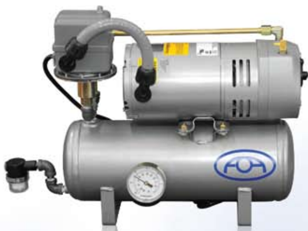
Item # 700-060

Over the years, Friddle's has provided the orthotics and prosthetics industry with top quality, innovative products. The Mini-Vac Vacuum System is another "standard setting" product. This vacuum system offers unmatched functionality and quality for your fabrication lab. Our "low maintenance" unit is designed for convenience and longevity using the finest materials and components available. For professional supplies and products...always consider Friddle's.