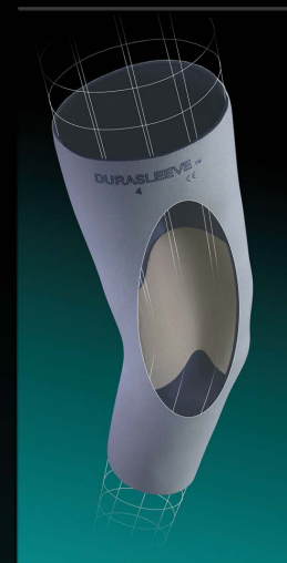
Durasleeve™ and Durasleeve HD™