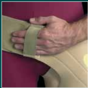
Hand loop eases application and closure